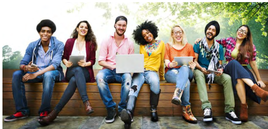
Young Adults 18-25