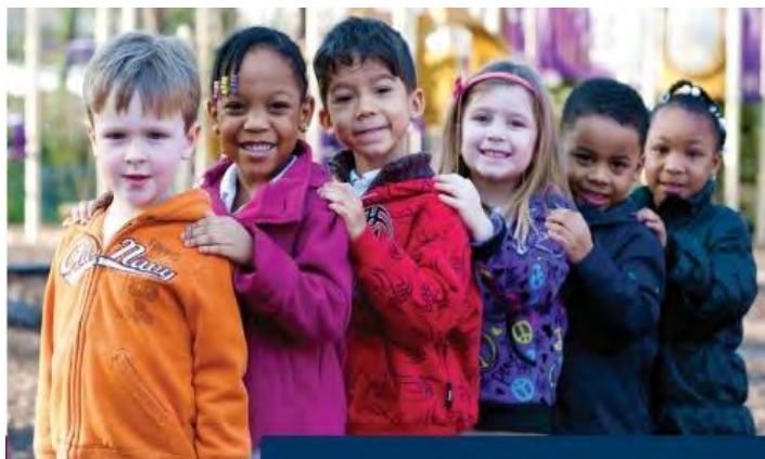
Parents of APS Students